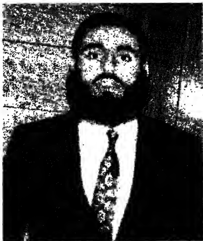
Mohammed Salameh, a suspect in the World Trade Center bombing, in a 1992 photograph supplied by his family.